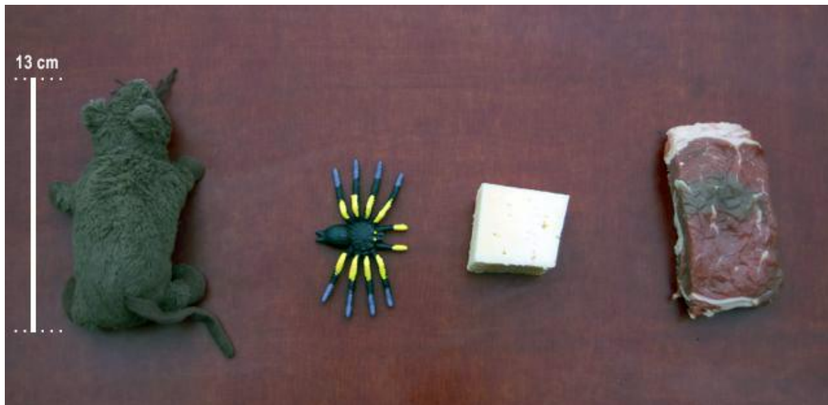
Figure 1. Examples of toys and food items used in the different conditions. From left to right: a stuffed toy rat, a colorful plastic spider, a piece of cheese, and a piece of meat.

Toys were selected to be of a character known to elicit intense play in enrichment activities: small stuffed animals and large plastic insects, ranging from eight to fifteen centimeters in length. Food was selected on the basis of previously established favorite food items: medium-sized (approximately 10-5x5x5 cm) chunks of cheese, meat and baked goods. (See Figure 1.)