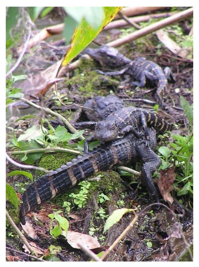
Figure 3. A hatchling American alligator (Alligator mississippiensis) riding on the back of an older individual in a multi-brood crèche, Fakahatchee Strand Perserve, Florida, USA.

An American crocodile ( Crocodylus acutus ), rescued and named Pocho by Gilberto 'Chito' Shedden, became a celebrity in Costa Rica for being absolutely tame and very playful with its rescuer.