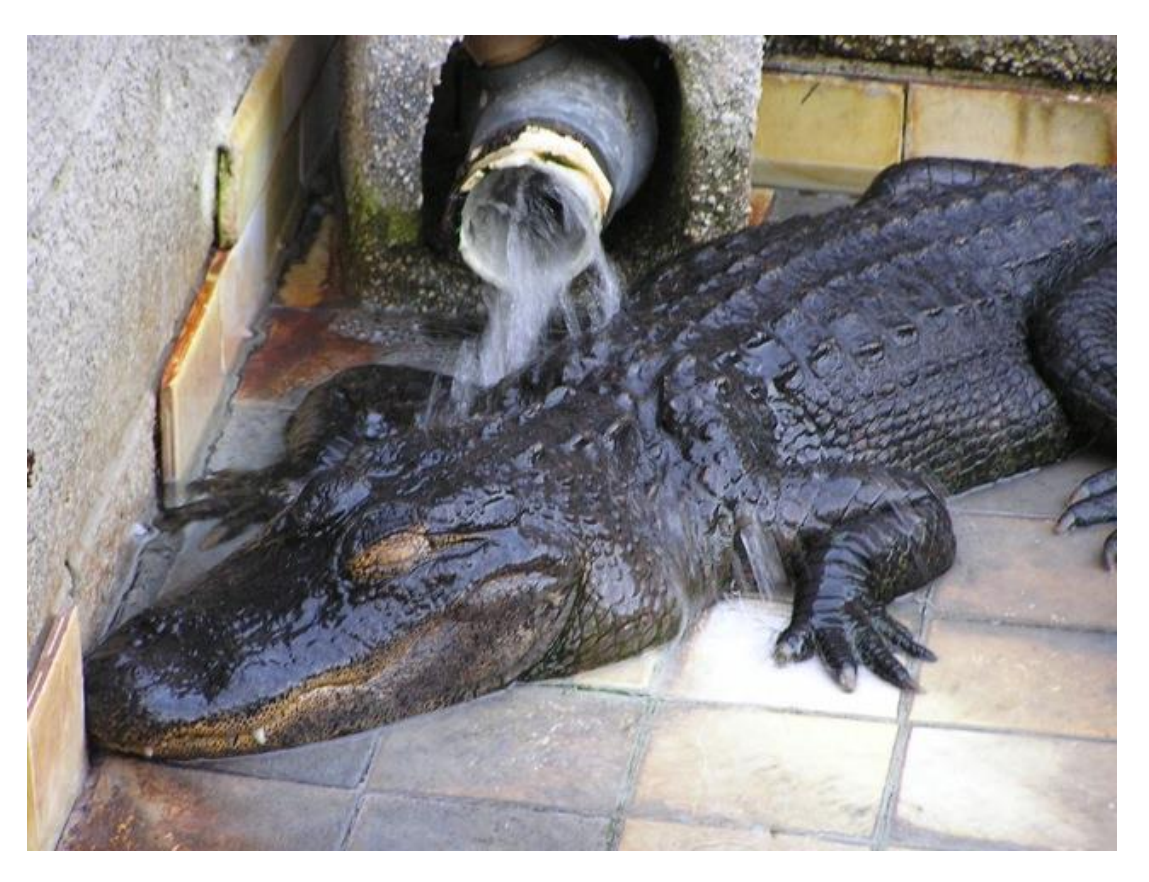
Figure 1. An American alligator (Alligator mississippiensis) resting after a bout of play with a stream of water, Saint Augustine Alligator Farm Zoo Park, Florida, USA.