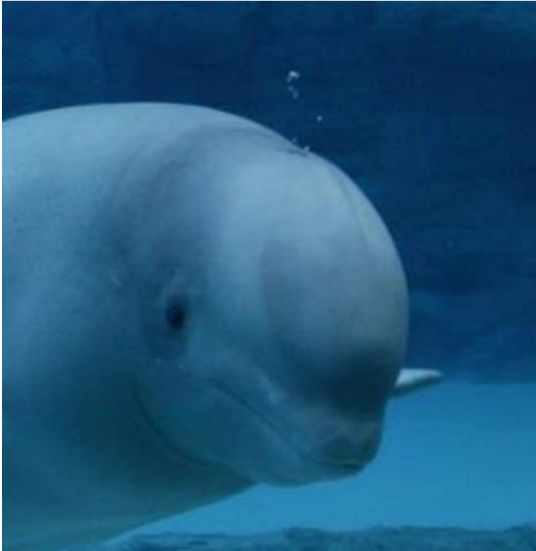
Figure 5. Blowhole Drip by a beluga whale.