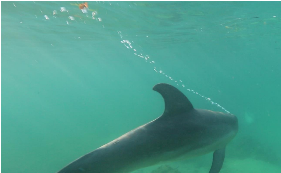
Figure 1. Bubble trail by an Atlantic bottlenose dolphin.

Bubble trails are iconic and widely reported in the literature. Their form consists of a long, thin stream of bubbles (Figure 1) that can be single streams or multiple visually distinct streams separated by very short intervals, referred to as a bubble trail bout (Beard, 2007). The two most common alternative names for bubble productions with these features are bubble streams and whistle trails. The vast majority of articles use the terms bubble trail and bubble stream interchangeably, though there are a few articles in which these terms are characterized differently on the basis of structure (e.g., Dudzinski, 1996) or on physical features and behavioral use (e.g., McCowan et al., 2000). The term whistle trail (e.g., Pryor, 1990; van der Woude, 2009) is exclusively used to refer to bubble trails emitted concurrently with whistles, although the features of the bubble emission are structurally identical. This term occurs in the acoustic literature and, along with the term bubblestream whistle (e.g., Fripp, 2005), is used with respect to the practice of using bubble trails to identify the whistling individual in view.