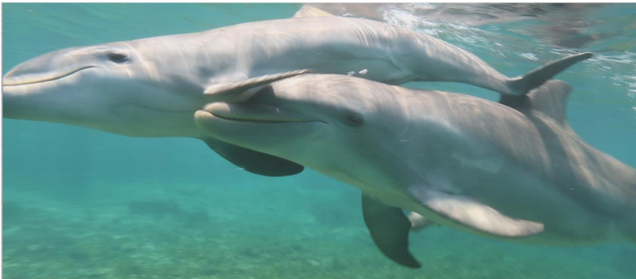
Figure 4. Scant bubble by an Atlantic bottlenose dolphin.

In addition to bubble trails, bubble bursts, and bubble rings, there are reports of bubbles that do not match the features of one of these categories. One bubble type that is clearly defined and does not fit into the well-established categories is called the scant bubble or blowhole drip. This type also contains a minimal number of bubbles, but it is distinct from the singular large bubble in terms of size. Our knowledge of this type comes from two reports, one of which defines it as bubbles that are “small, sparse, and few” (Moreno, 2017, p. 12; Figure 4).