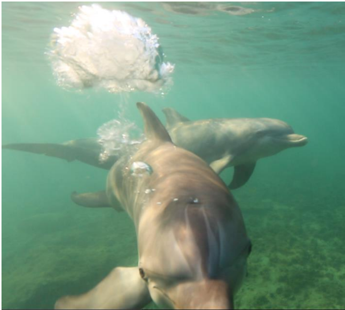
Figure 2. Bubble Burst by an Atlantic bottlenose dolphin.

Another common form of bubble production is the sudden release of a large amount of air resulting in a cloud-like clustering of bubbles (Figure 2). Various sources commonly refer to this as either the bubble burst or bubble cloud, and the choice of which term is used appears to be due to author preference, though they can also be used interchangeably as in Dudzinski (1996). One exception to this is McCowan et al. (2000), in which the terms are used to denote separate categories defined on the basis of social context rather than bubble features. The authors describe the physical features of both as “a large number of small bubbles simultaneously released” (p. 100), specifying that bursts occur in surprise or fright contexts but clouds occur during aggressive interactions, particularly those including chases (McCowan et al., 2000). Defining bubble types by behavioral context rather than physical features has drawbacks, including difficulty ensuring terms are used consistently throughout the scientific community and confounding studies attempting to understand the function of those behaviors.