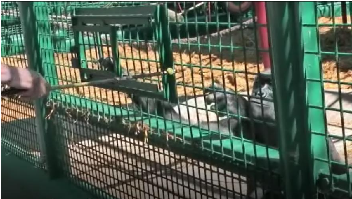
Figure 2. The moment when Matibe finally obtains the grape after repeated communicative bouts with humans.

The communicative instance observed can be defined as consisting of two inter-dependent triadic interactions. The first triad consisted of Matibe, a zoo visitor, and the grape on the ground as the external object; the second triad included Matibe, a zoo visitor, and the stick that was offered to the visitor as the external entity. It is of interest that Matibe, in the first triadic interaction, used the stick as a pointing device, whereas in the second triad the stick was the external object that was referred to in the communicative dyad. This indicates quite a sophisticated level of cognitive flexibility in the use of a tool for different purposes. Ultimately, it could signify that the whole communicative act included the flexible relationship between two different external objects, put into words as (1) “look here to the grape on the ground that is just too far away for me to reach it“ and (2) “please spike it with this stick and then pass it over to me!“