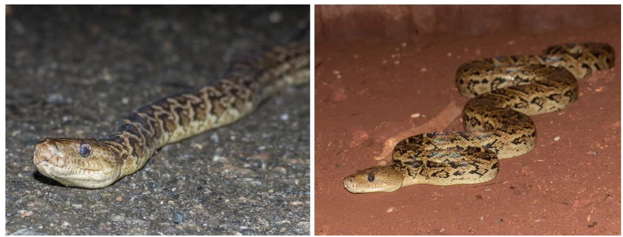
Figure 1. Cuban boas ( Chilabothrus angulifer ) at the entrance of a sinkhole cave, Desembarco del Granma National Park, Cuba. Note the high variability of individual markings. Photography was not used inside the cave to avoid disturbing boas and bats.

After sunset and before dawn, some of the boas entered the passage that connected the roosting chamber with the entrance chamber, and hunted by suspending themselves from the ceiling and grabbing passing bats.